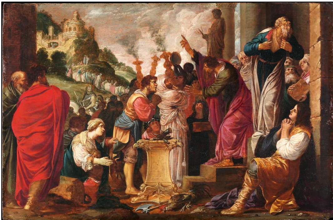
PYNAS, Jacob Symonsz, Paul and Barnabas at Lystra, 1627-29