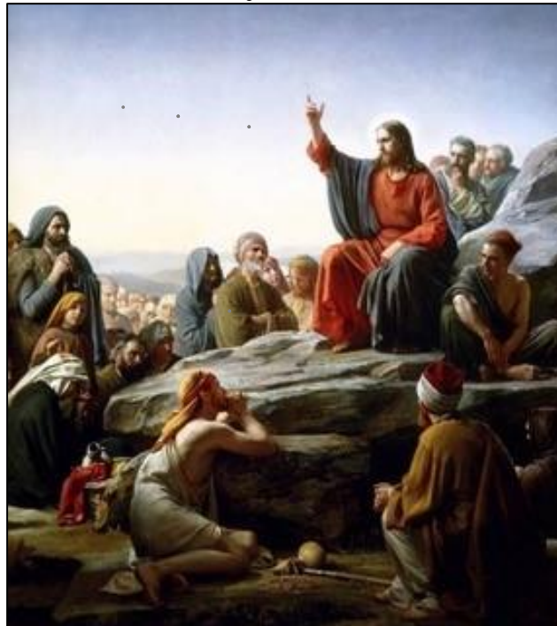
BLOCH, Carl Heinrich, The Sermon on the Mount, 1877