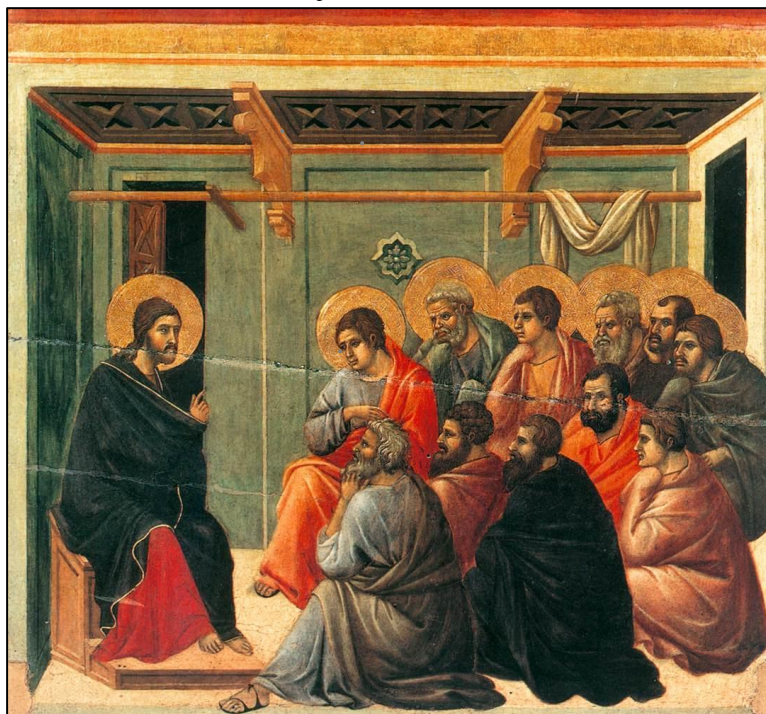
BUONINSEGNA, Duccio di, Christ Taking Leave of His Apostles, 1308-11