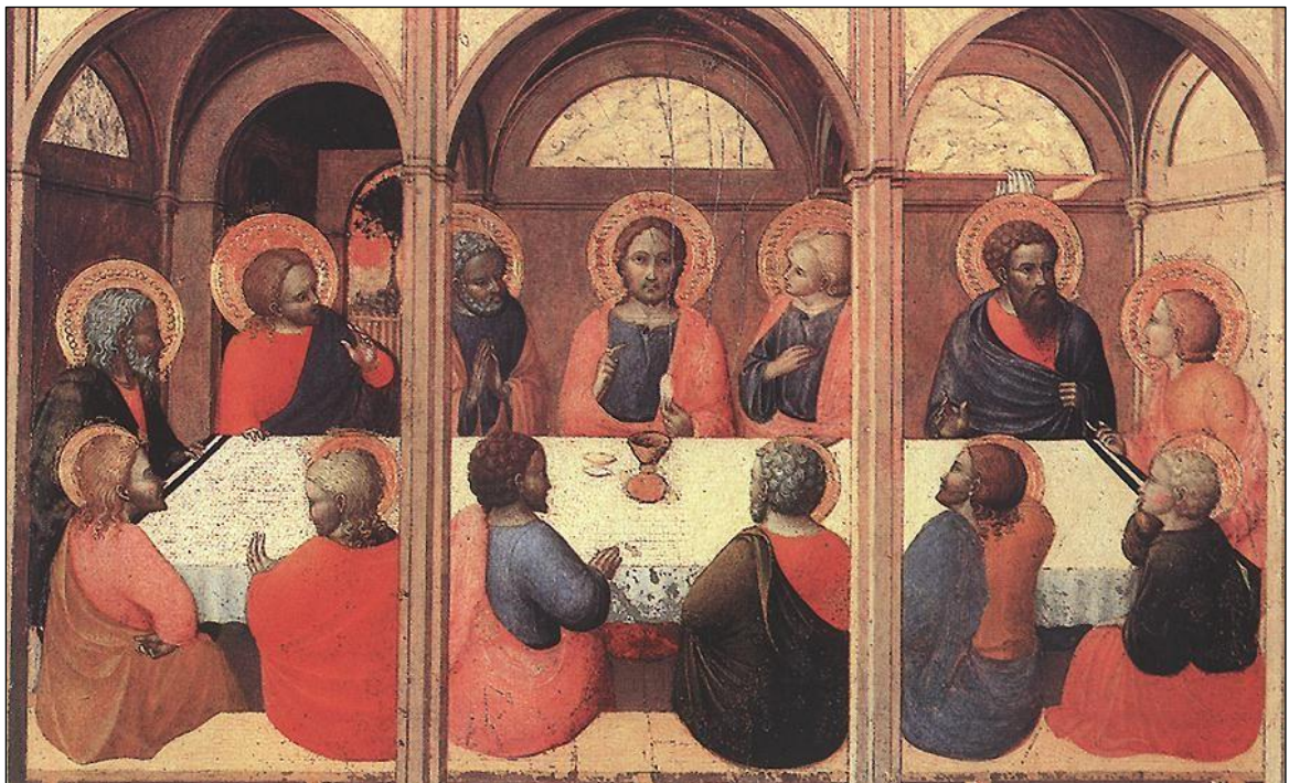
SASSETTA, Stefano di Giovanni, The Last Supper, 1423