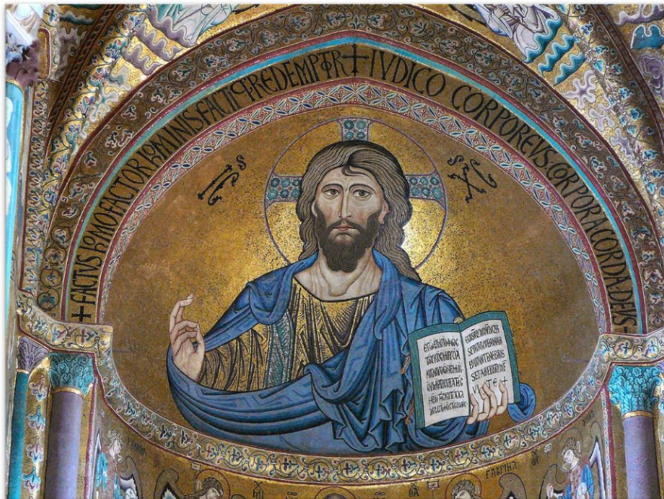
Christ Pantokrator, Righteous Judge & Lover of Mankind, Cathedral of Cefalu, Sicily