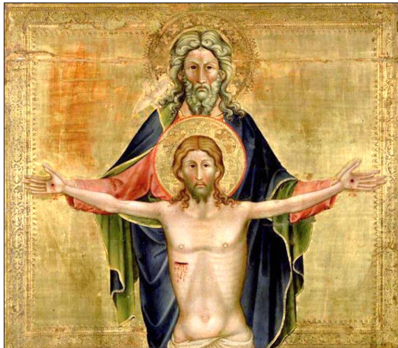
Nicolò Semitecolo, The Holy Trinity. c. 1370 Padova