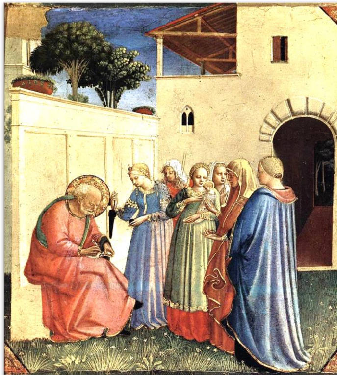
ANGELICO, Fra. The Naming of St John the Baptist, 1434-35