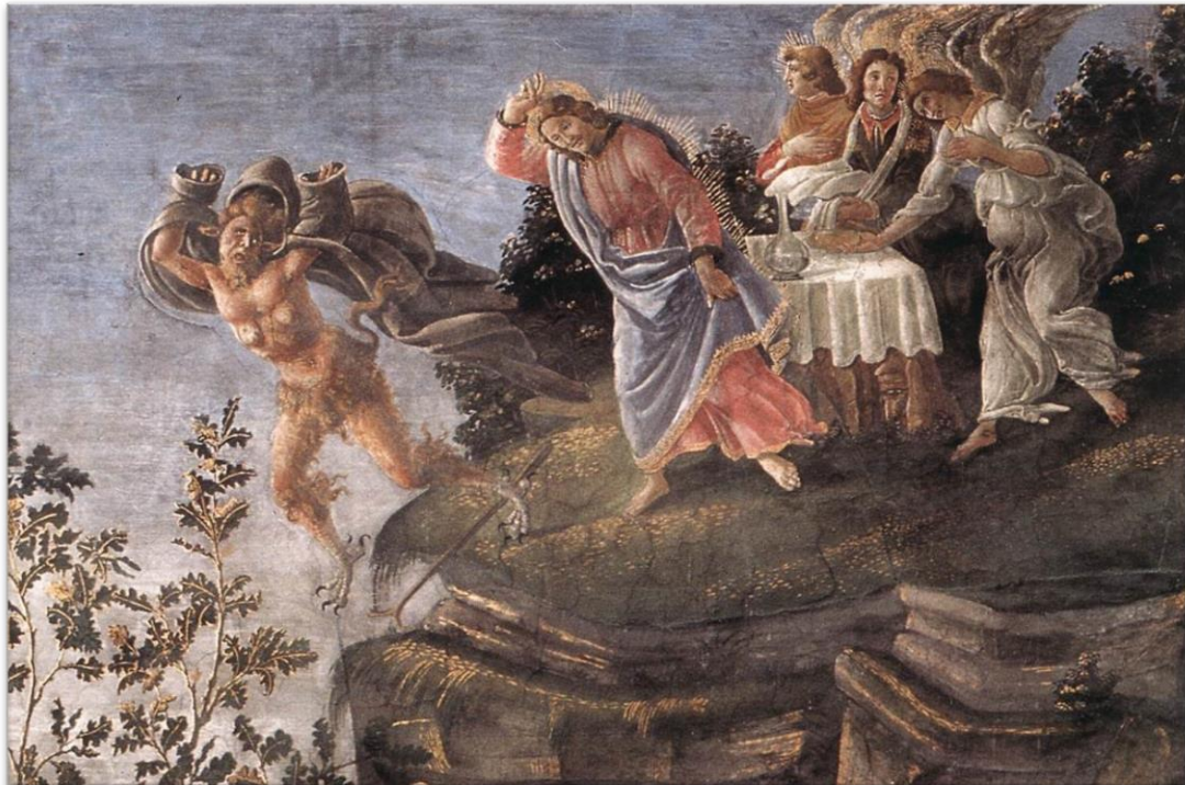
BOTTICELLI, Sandro, The Temptation of Christ (detail, 1481-82)