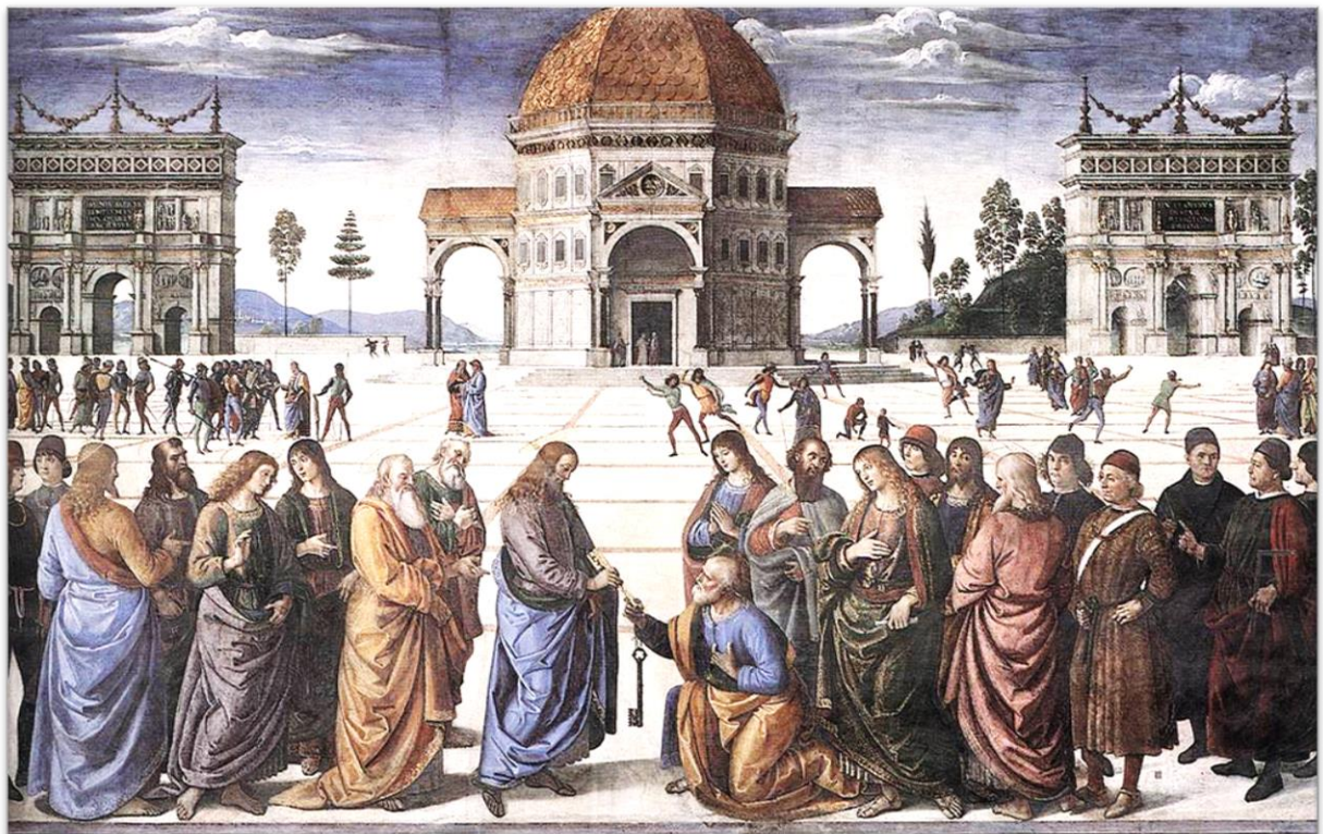
PERUGINO, Pieter, Christ Giving the Keys to St Peter, Sistine Chapel, Rome