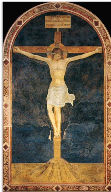
ANGELICO, Fra, Crucified Christ, 1433-34