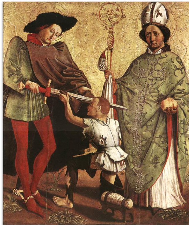
UNKNOWN MASTER, St Martin of Tours & St Nicholas of Bari, 1450