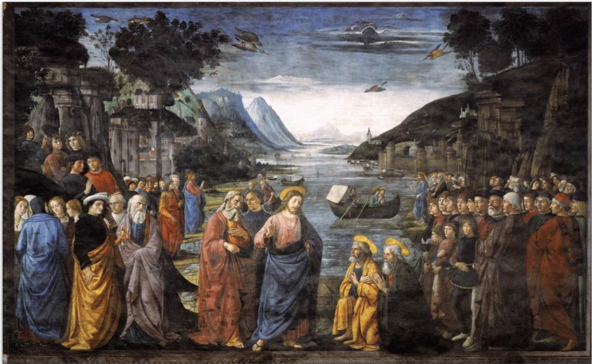
GHIRLANDAIO, Domenico, Calling of the Apostles, 1481, Cappella Sistina, Vatican

(Australia Day) 26 th January 2020, Year A/2