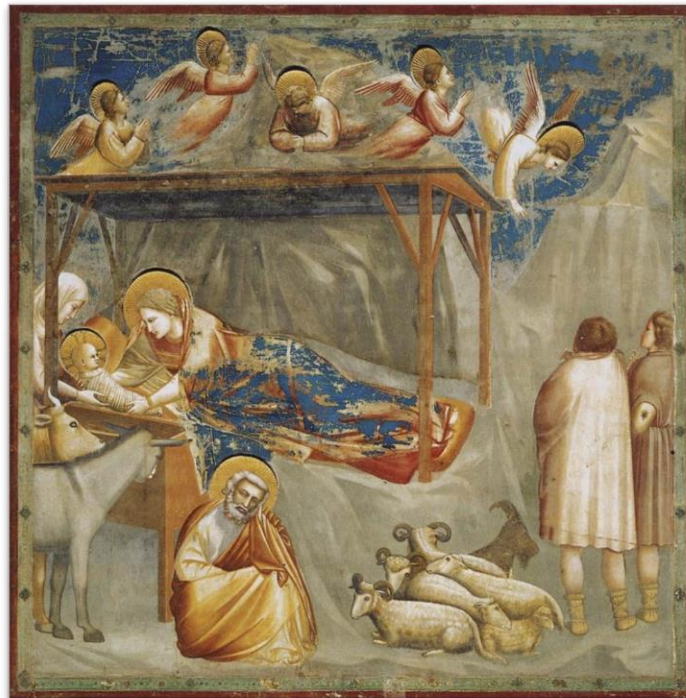
GIOTTO di Bondone, Nativity of Birth of Jesus 1304-06