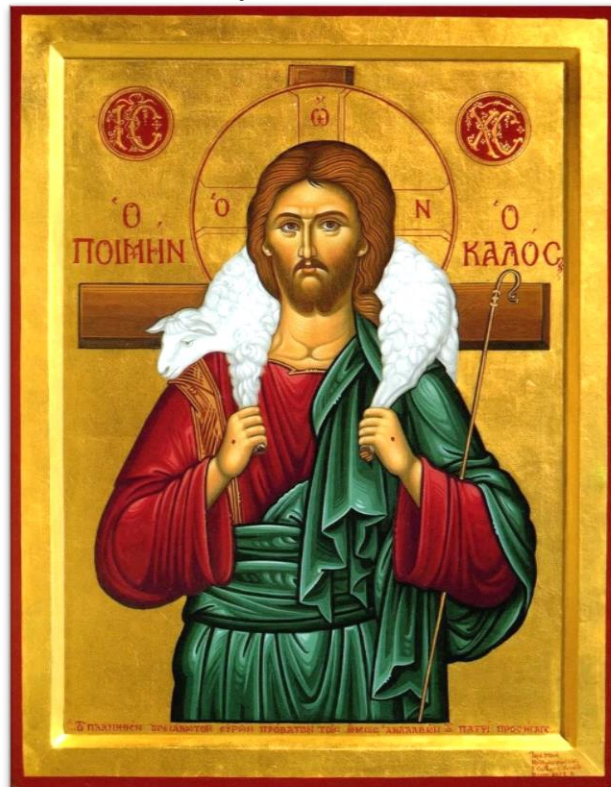
Christ The Good Shepherd Icon