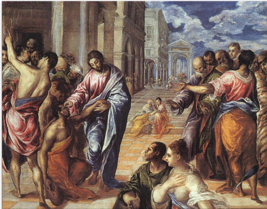
EL GRECO, Christ Healing the Blind Man, 1567