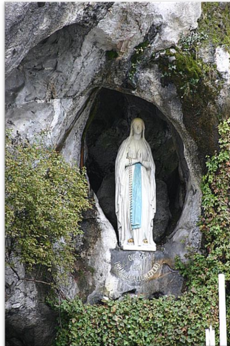
Our Lady of Lourdes Grotto, 2014