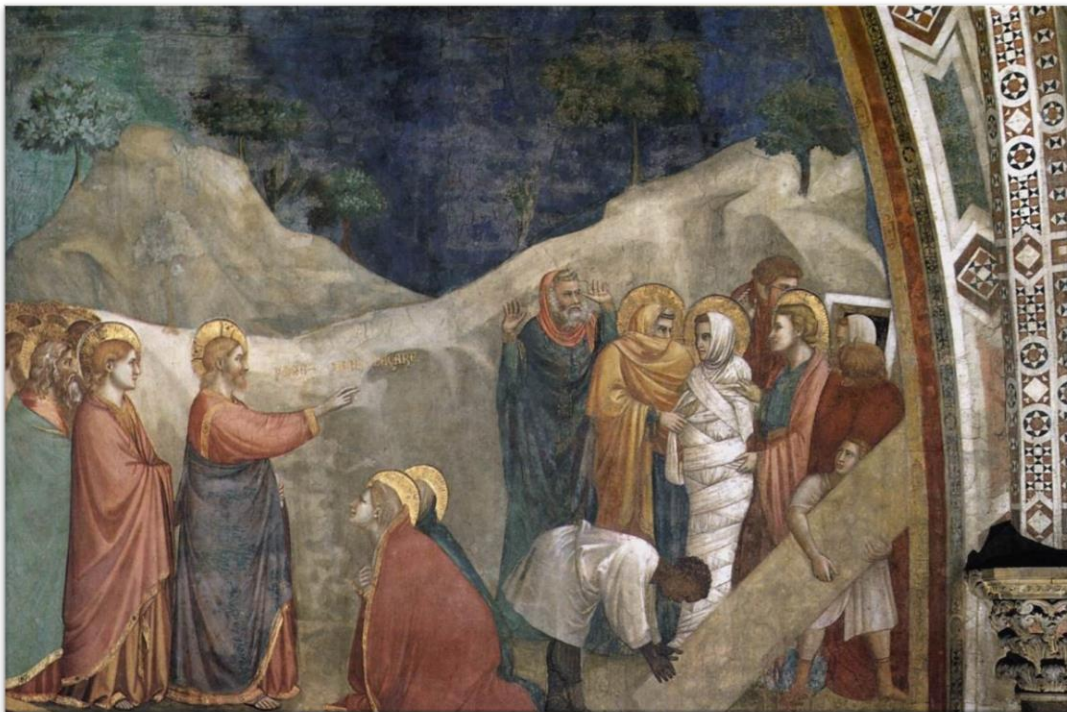
BONDONE, Giotto Di, Raising of Lazarus, 1304-06