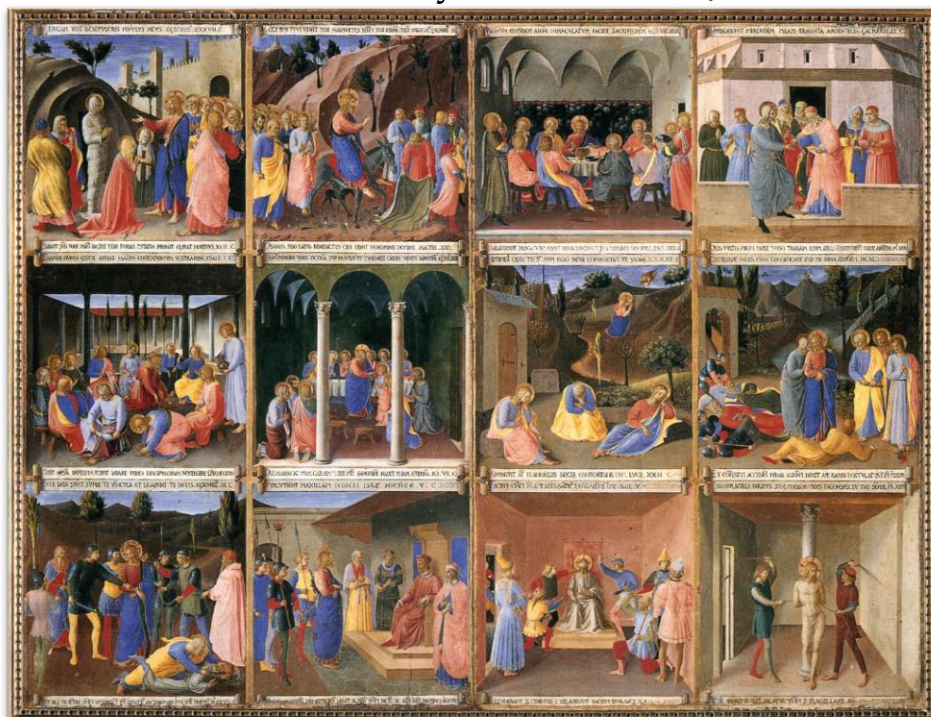
ANGELICO, Fra, Scenes from the Life of Christ, 1451-52