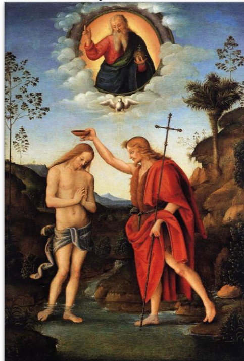
BACCHIACCA, Baptism of Christ, c. 1520