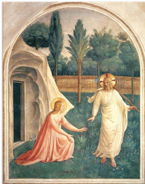
ANGELICO, Fra, Noli Me Tangere, 1440-1442