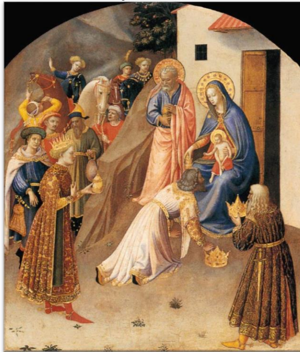
ANGELICO, Fra, Adoration of the Magi, 1423-24