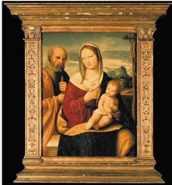
PISANO, Nicola, The Holy Family, 1500s