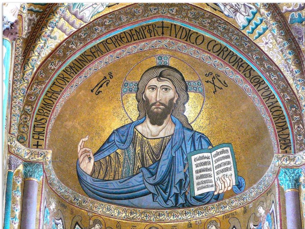
Christ Pantokrator, Righteous Judge & Lover of Mankind, Icon in Cathedral of Cefalu, Sicily