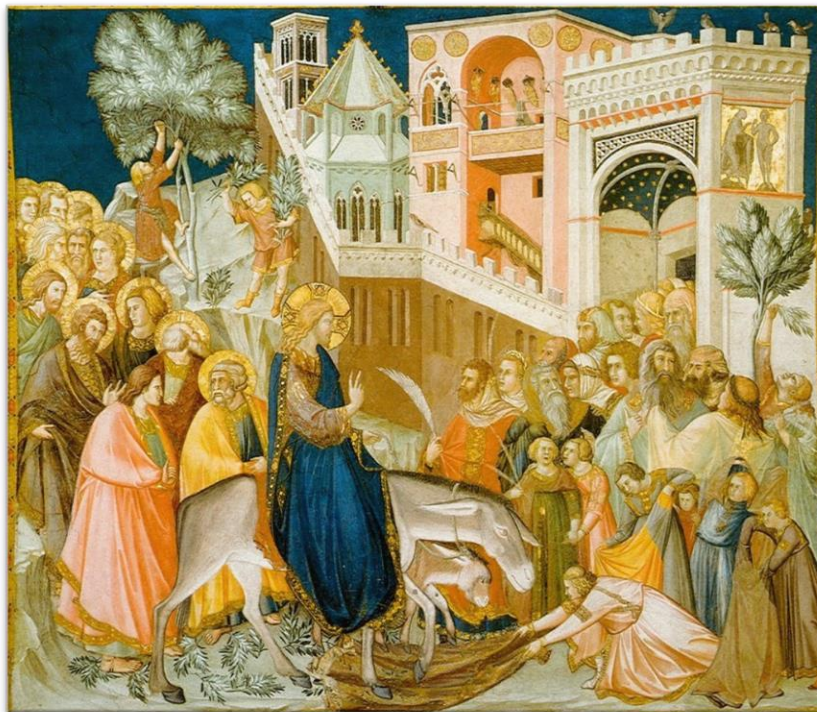
LORENZETTI, Pietro, Entry into Jerusalem, 1320