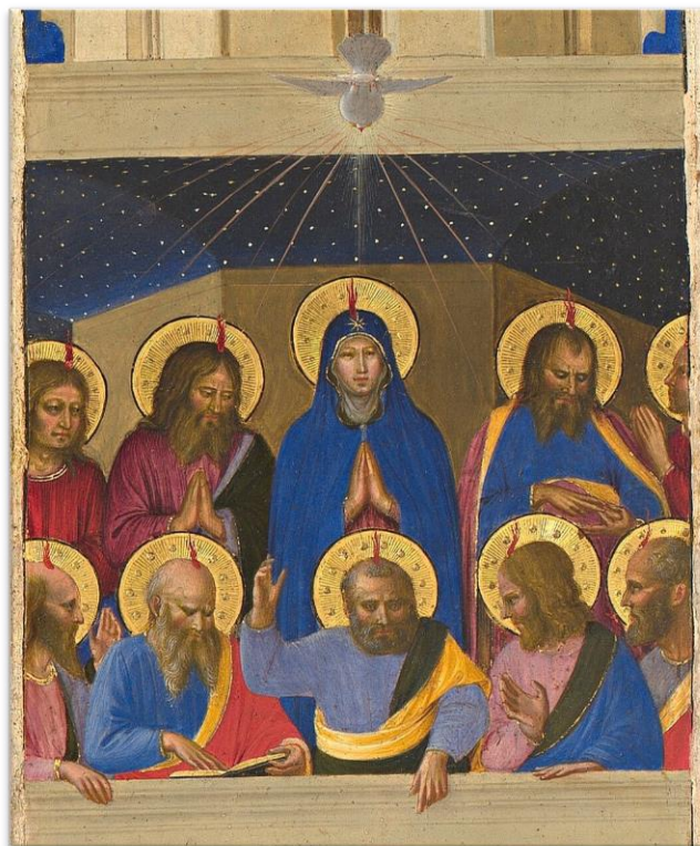
ANGELICO, Fra, Triptych of the Last Judgment, Ascension, and Pentecost Det. (1450-1455)