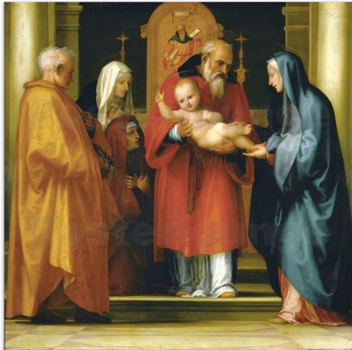
ANGELICO, Fra, Presentation of Jesus in the Temple, 1440