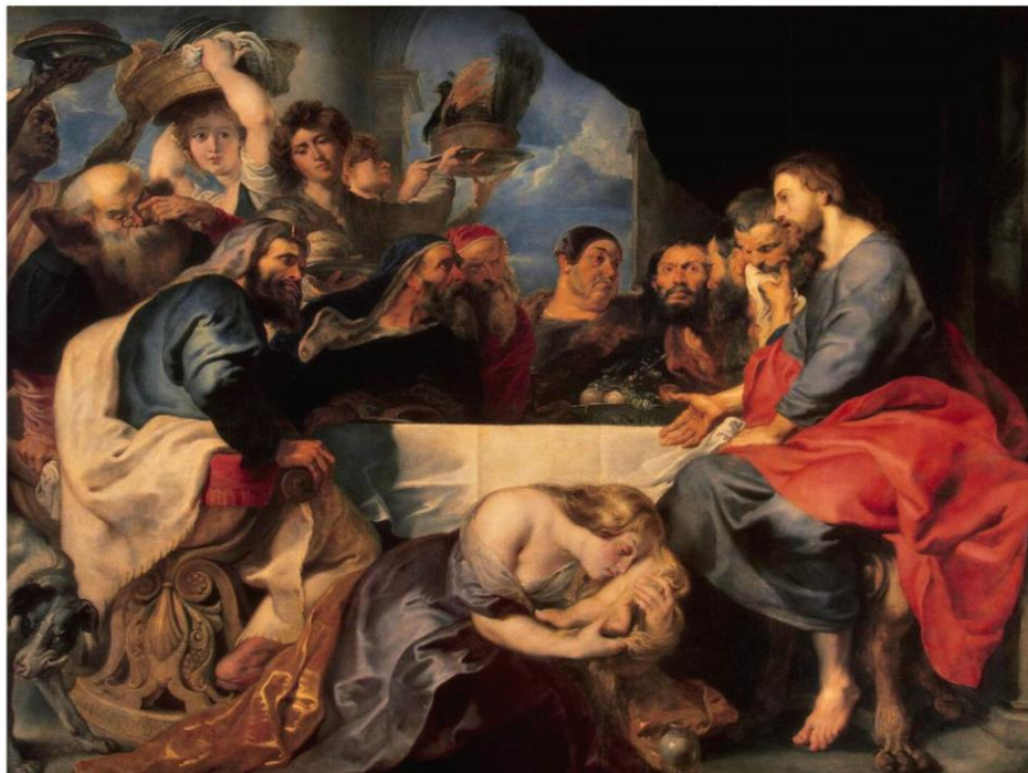
RUBENS, Peter Paul, Christ at Simon the Pharisee 1618-20