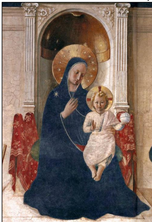
Fra Angelico, sacra Convesazione, ca 1443 (fresco)