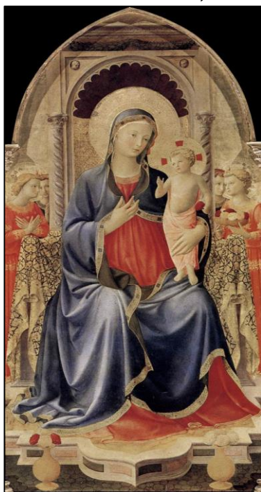
Fra Angelico, Cortona Polyptych