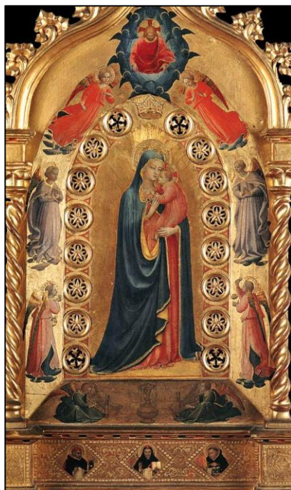
Fra Angelico, Madonna of the Star ca. 1424