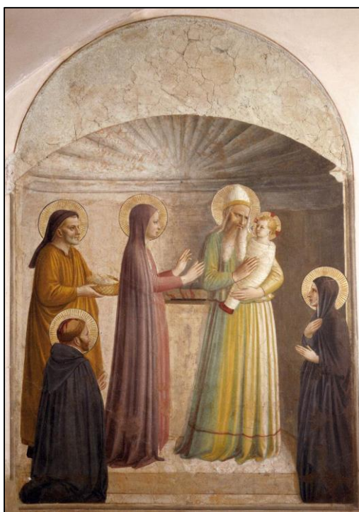
ANGELICO, Fra. Presentation of Jesus in the Temple (Cell 10), 1440-42