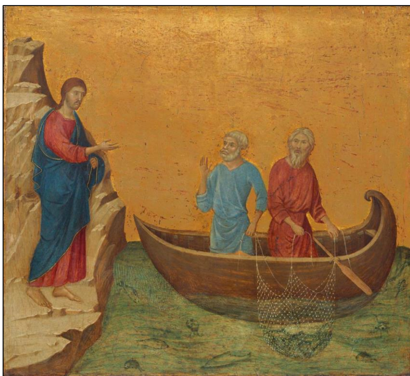
DUCCIO di Buoninsegna, Calling of Peter and Andrew (scene 4)